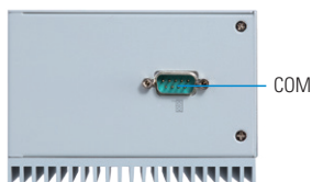
▲ Bottom view